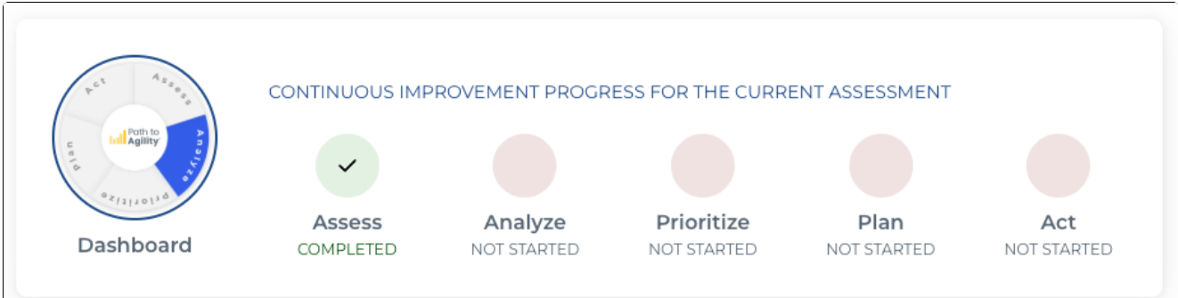
Image. Snapshot of a single business unit's progress during the current assessment cycle. This business unit has completed the Assess phase and is ready for the Analyze phase.

This view provides clarity on where that business unit is on the continuous improvement wheel. As a brief aside, the wheel represents a repeating process for improvement that resets with each new assessment. The full knowledge base article can be found here .